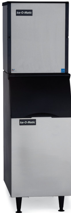
ICEO926 ON B42