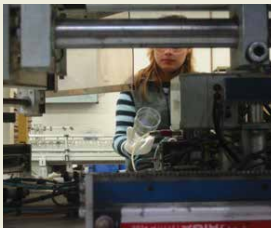
Every piece is inspected for quality.