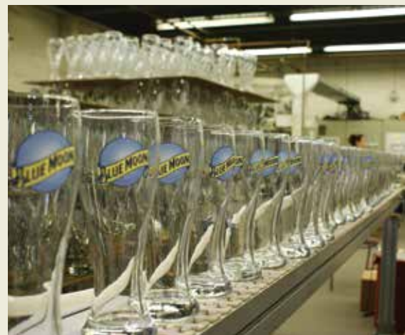
We are equipped to mass produce large orders with our fully automated machines. Glasses ride along the belt to be automatically loaded into the oven for firing.