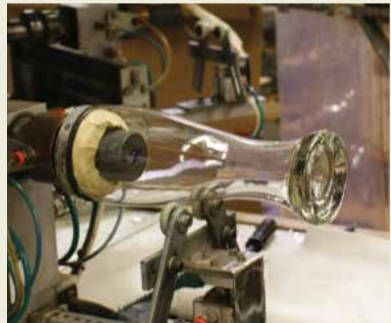
Cardinal's precision equipment is meticulously calibrated to ensure quality output on every production run.